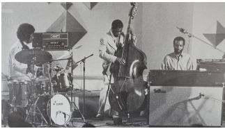
Ahmad Jamal Trio