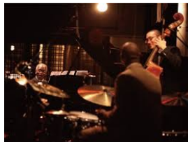
Hank Jones Trio