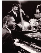
Wynton Kelly Trio