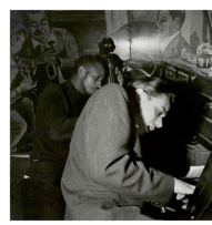
Horace Silver Trio