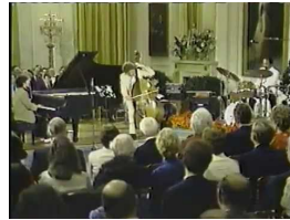
Chick Corea Trio