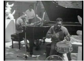
Duke Ellington Trio