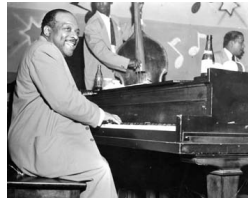
Count Basie Trio