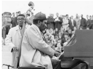
Thelonious Monk Trio