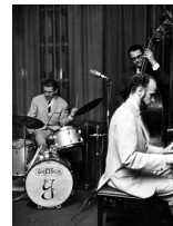
Jan Johansson Trio