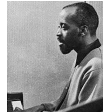
Junior Mance Trio