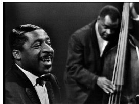
Erroll Garner Trio